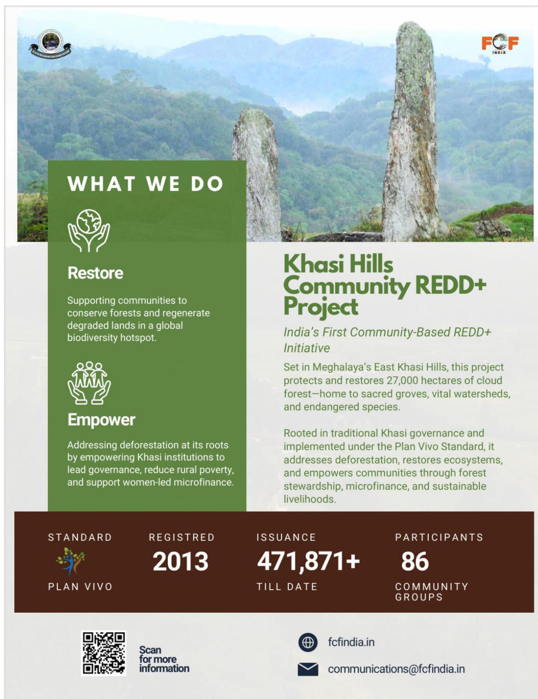
Figure 2 Project Flyer of Khasi Hills Redd+ Project